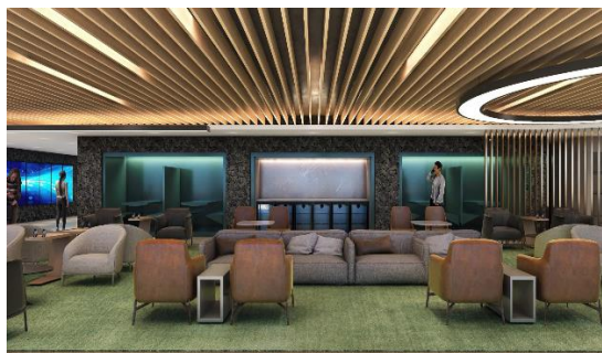
First Plaza Premium Lounge at São Paulo/Guarulhos International Airport to be opened in Mid-September (Rendering image)